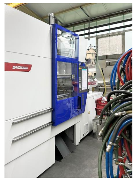
The new SmartPower injection molding machines increase the energy efficiency of the injection molding production.