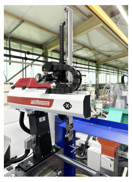
The new WX90 sprue removal systems with rotary servo axes are equipped with an R9 control system and thus completely integrated in the production cell.

The Production Manager Christian Cassierer appreciates the many practical features of the WITTMANN machines, which simplify processes and make them more efficient.